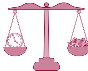
It's all a balancing act

Any savings made from a Practice's budget are permitted to be reinvested into funding further services for patients. We are committed to spending all of our savings to expanding services in Market Harborough. If approved by the PCT we hope to use part of our savings for extra staff to man an Out of Hours service.